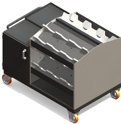
Mold carrier truck