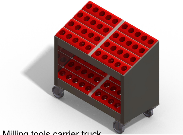
Milling tools carrier truck