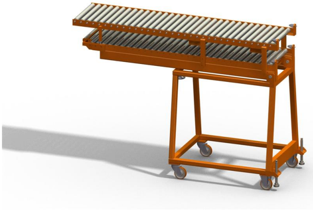
Mold carrier truck

As for handling systems accessories, we designed and manufactured the following trucks and trolleys that can be manufactured in standard or customized version: