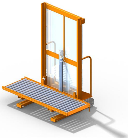
Lift truck for